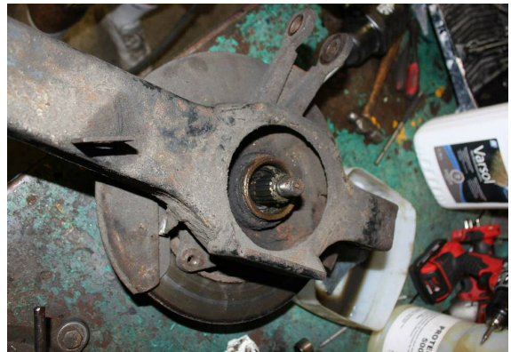
Close up of the old trailing arm with the spindle nut and flange removed.