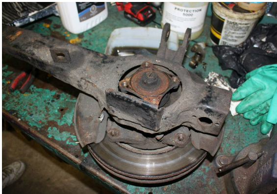
Close up of the old trailing arm showing the spindle nut and flange.