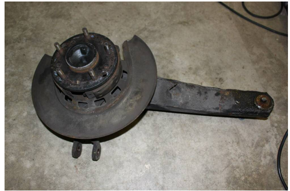
Passenger side trailing arm removed