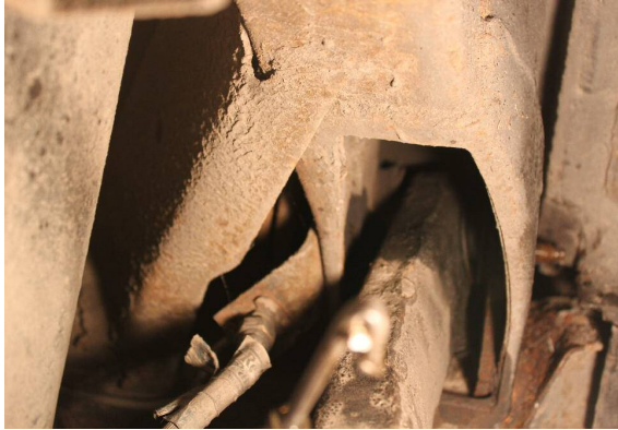
Close up of the trailing arm with the castle nut removed and the pivot bolt still in place.

Note the vertical alignment skew of the trailing arm even with the shims still there.