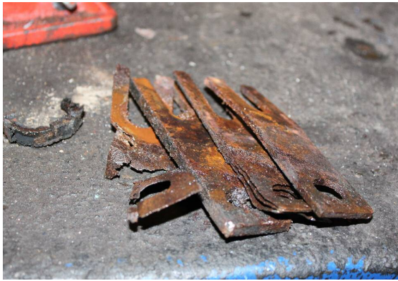
Passenger side inboard shims and bushing remnants