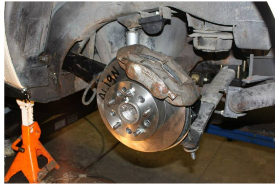
New drivers side trailing arm in place. Elapsed time 2.5 hours.

Total time for both sides was 7.0 hours before bleeding the brakes and doing the final check and test drive.