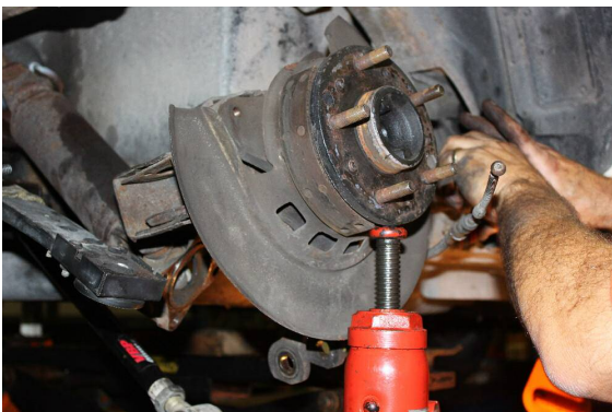
Use of bottle jack to support trailing arm and allow clear access to shims