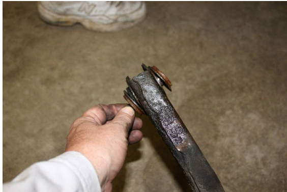
Note the "little bit" of play in the passenger's side pivot bolt and bushing.