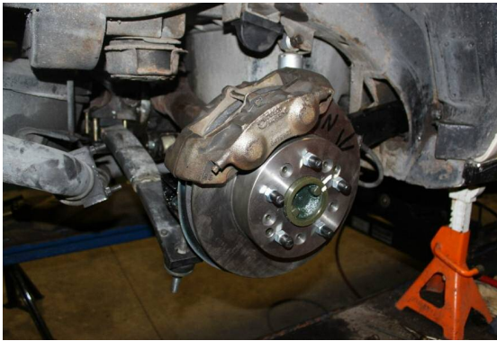
New passenger side trailing arm in place. Elapsed time 3.5 hours.