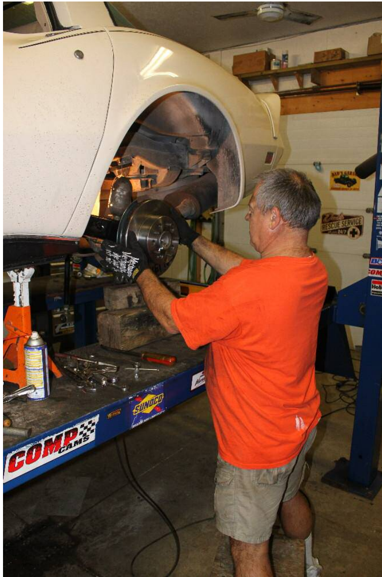
The master at work while his “assistant” takes pictures