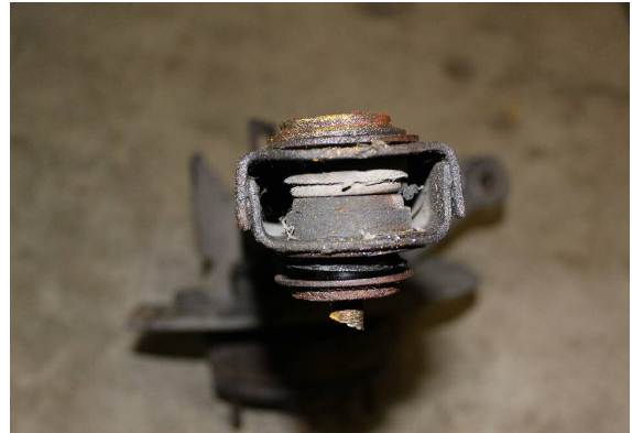
Close up of the passenger side bushings, notice one side bushing has deteriorated and is missing.