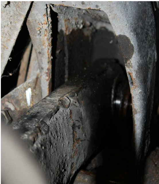
Close up of the trailing arm with the shims removed.