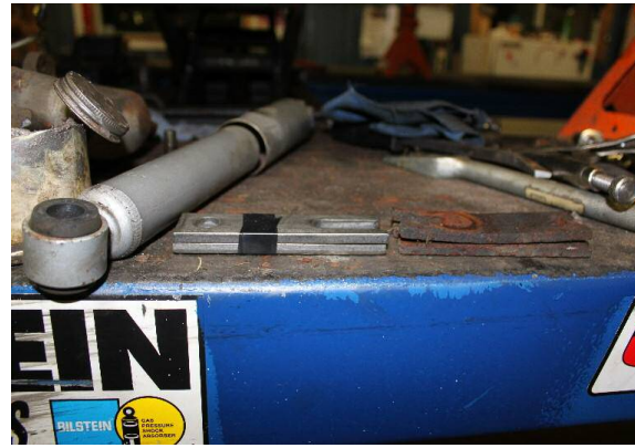
Old shims on the right, new matching thickness shims on the left.