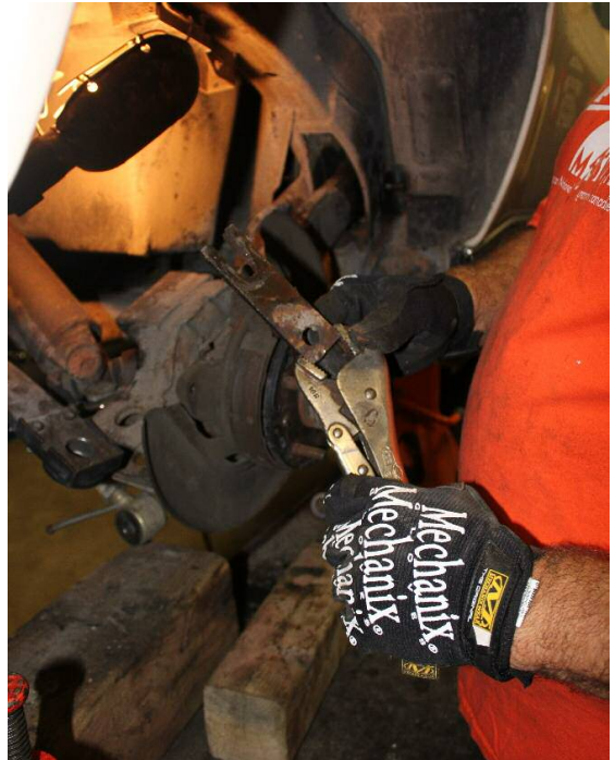
Close up of the first shims to be removed.

Note the vertical alignment skew of the trailing arm even with the shims still there.