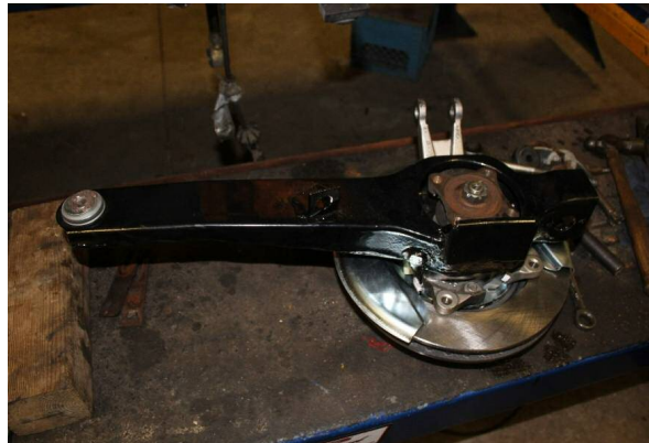
New trailing arm with the old spindle nut and flange installed and tightened to 100 ft-lbs.