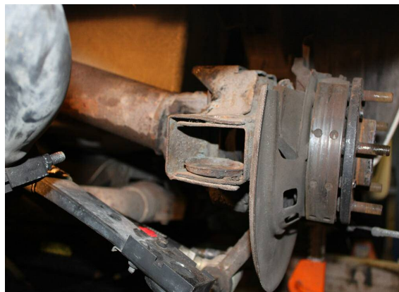
Close up of the passenger side trailing arm box shape. Note the apparent deformation of the two halves of the box shape