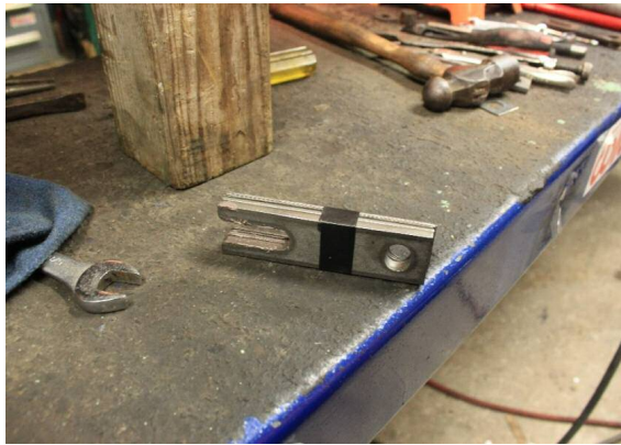
New shims taped together for ease of installation.