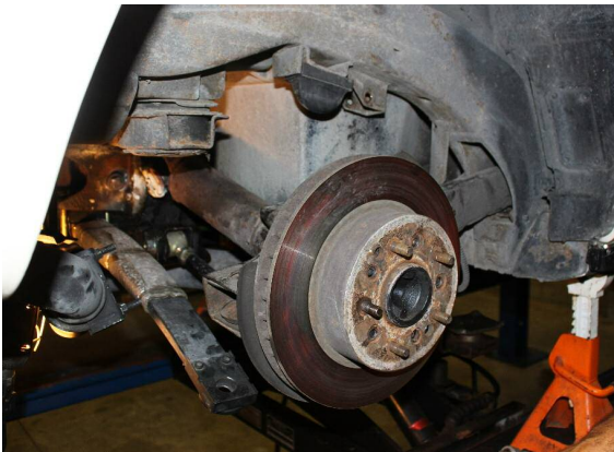
Original passenger side trailing arm, almost ready to remove