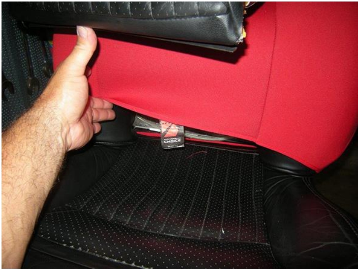
Pull the bikini all the way down. Pull the backpart over the seat. The tag should be on the bottom front.