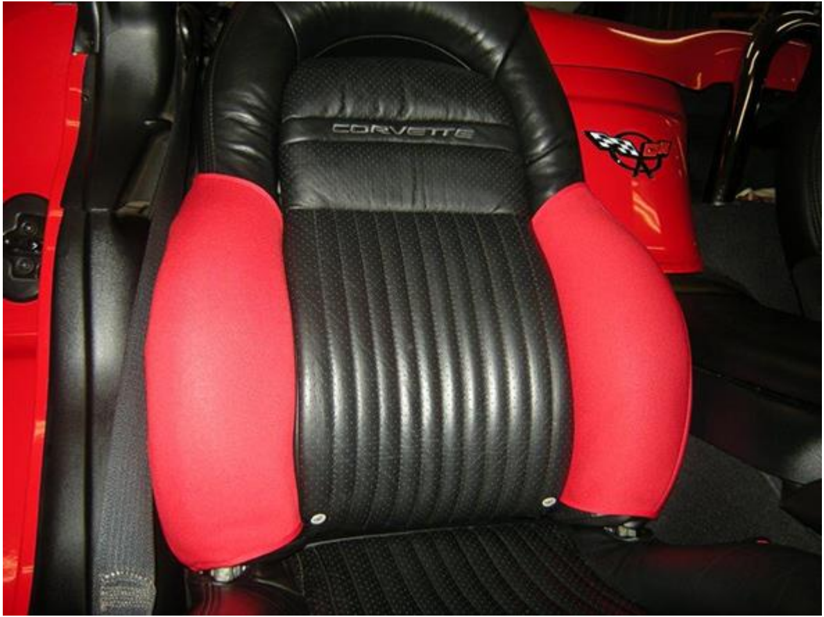
Reinstall the seat (it will still be heavy!) by reconnecting the electrical connectors, nuts and plastic covers.