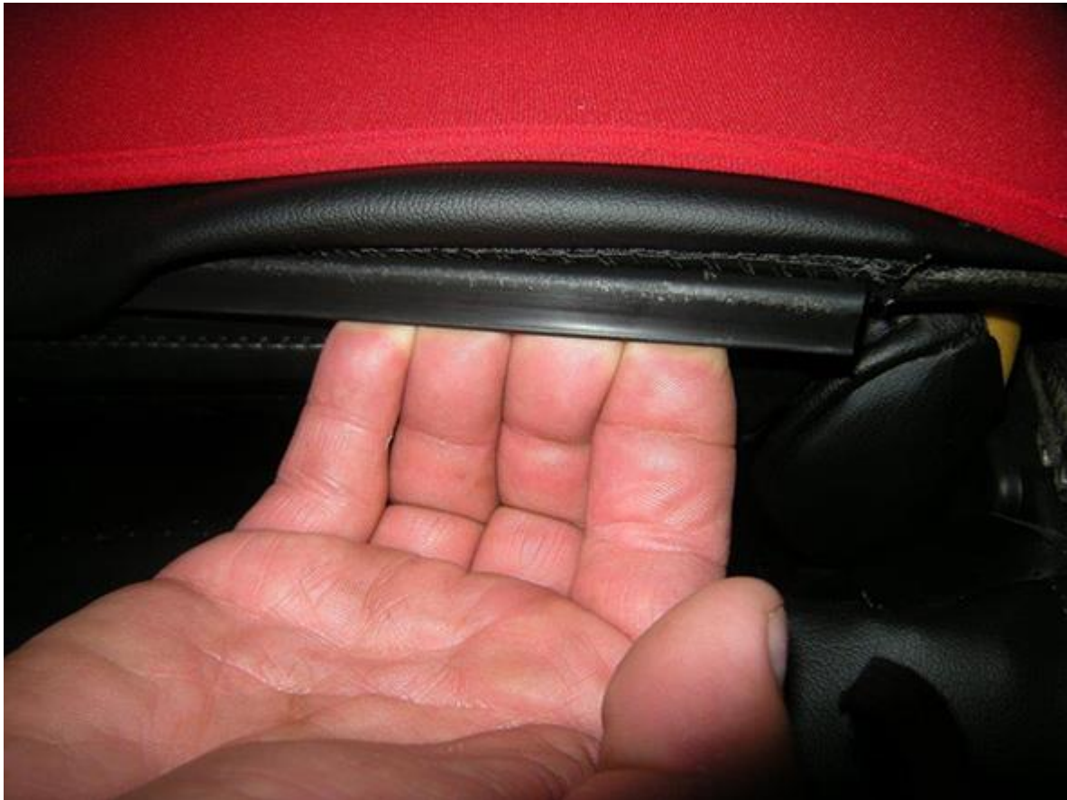
From the back of the seat, hook your fingers in the plastic seat clip.