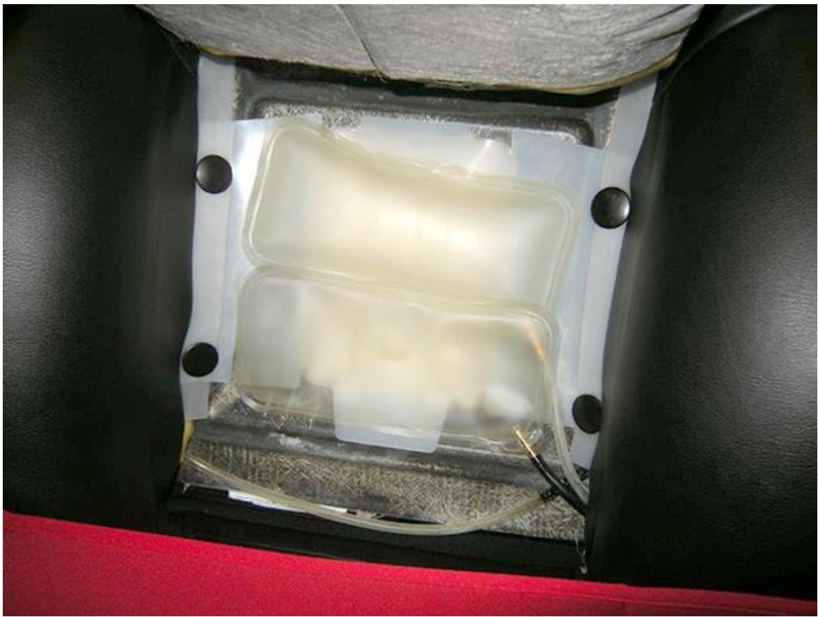
Looking into the back of the seat. You can see an airbag/seat bolster.