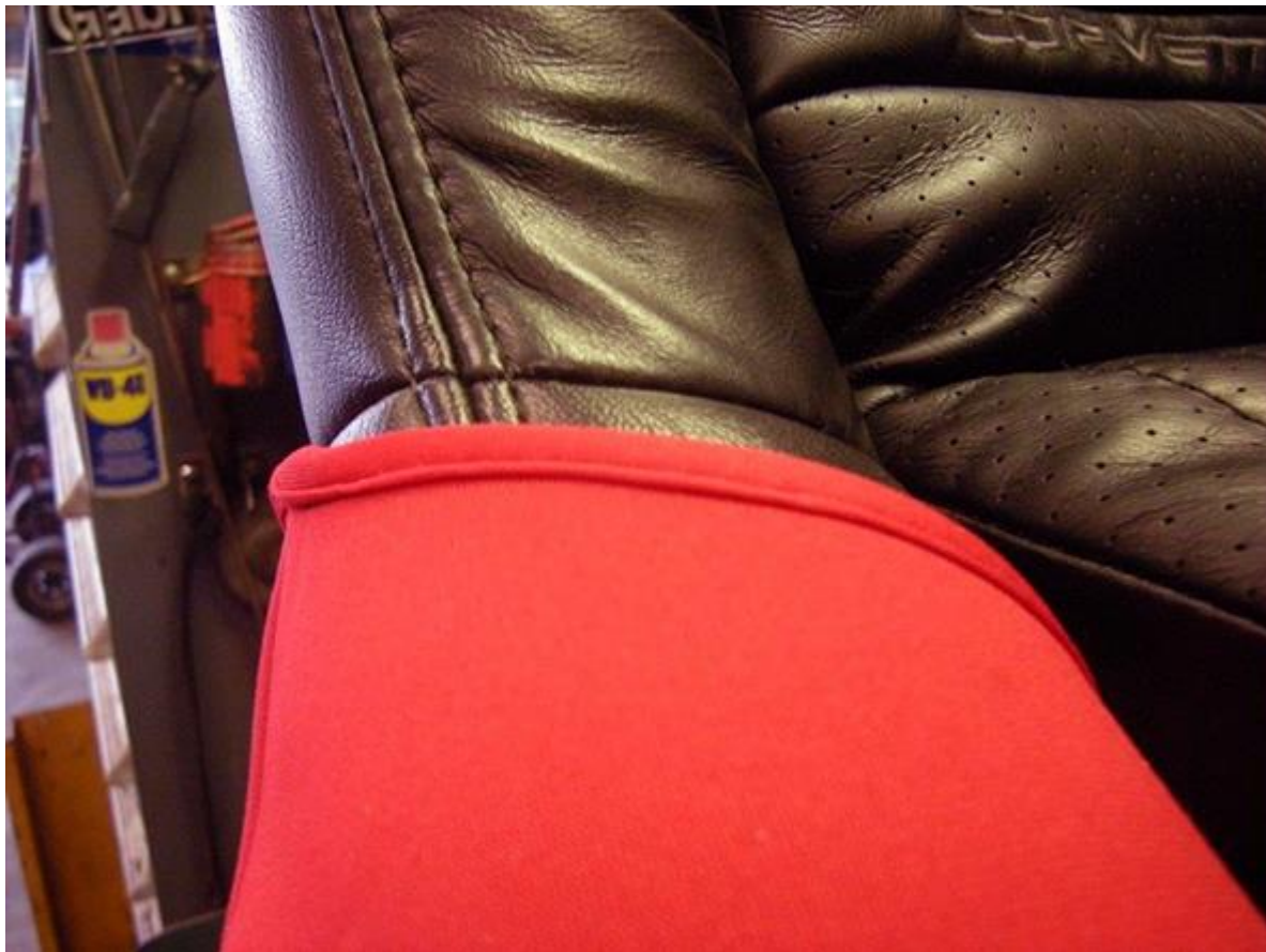
The edge of the bikini should follow the seams/creases in the seat.