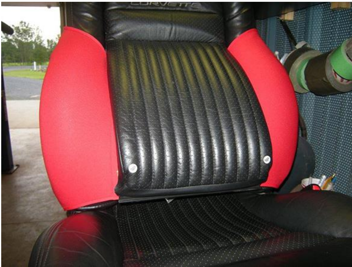
Once the bikini is in place, tuck in the bottom back of the seat.