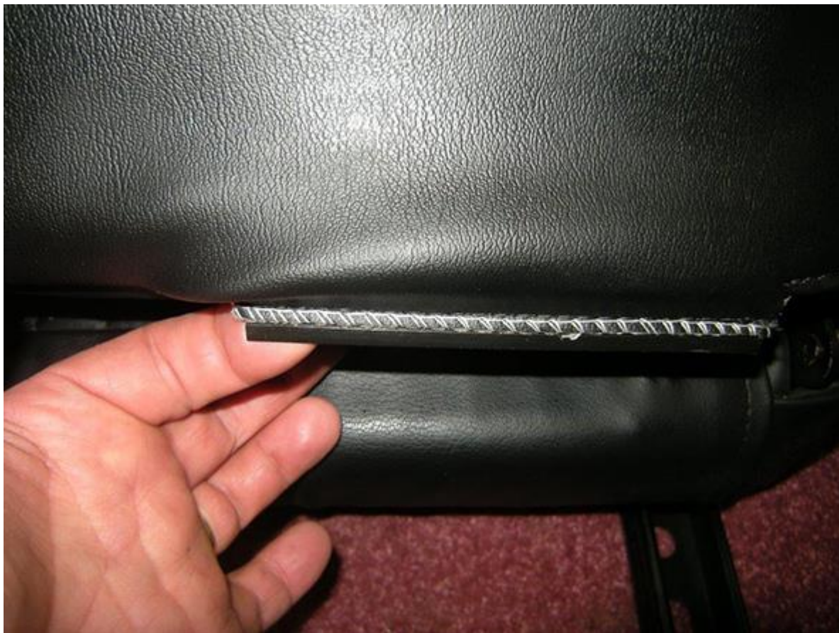
Insert the bottom of the original seat cover into the clip to secure it in place. Do one side at a time.