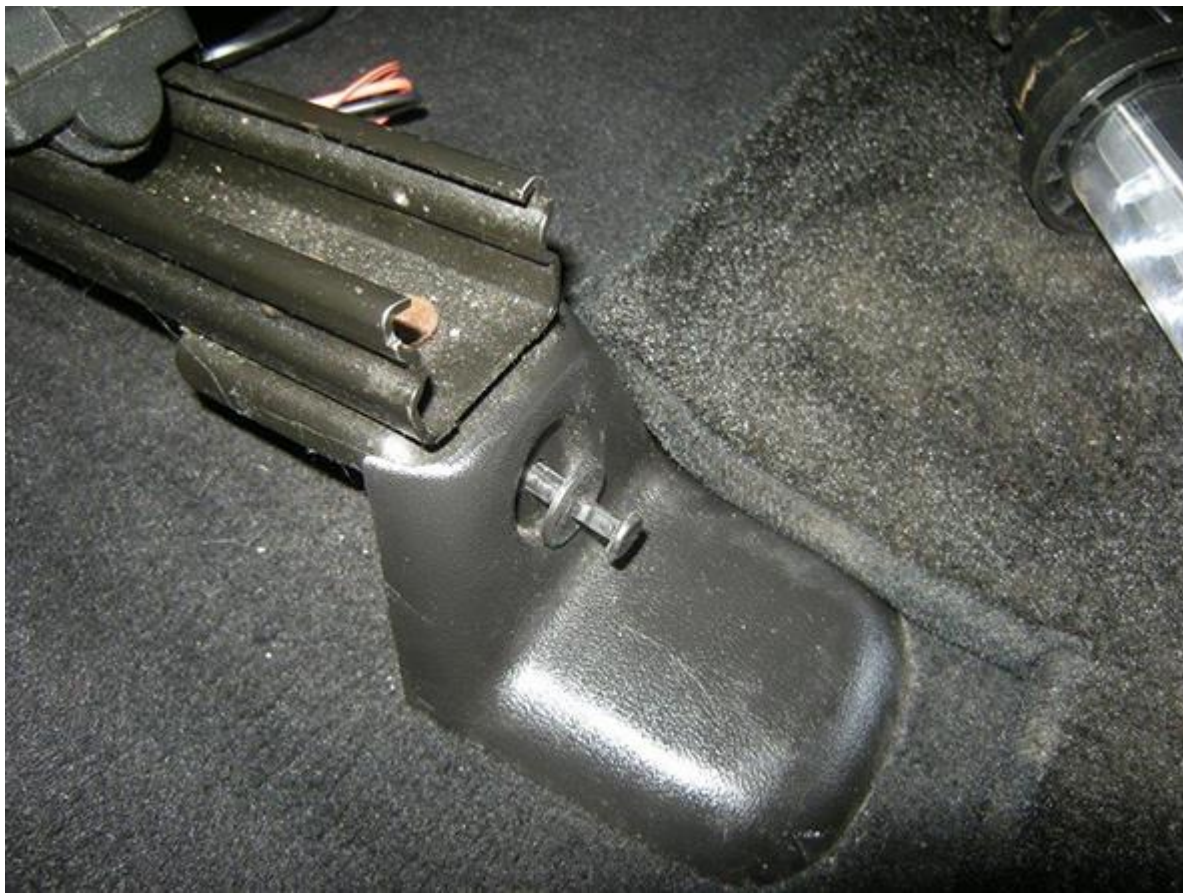
Pull the pin out.