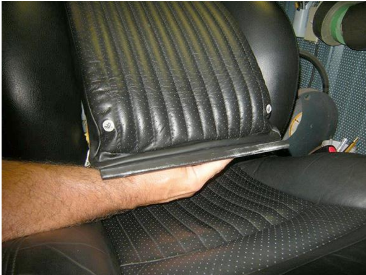
Seat Back unclipped - viewed from the front of the seat.