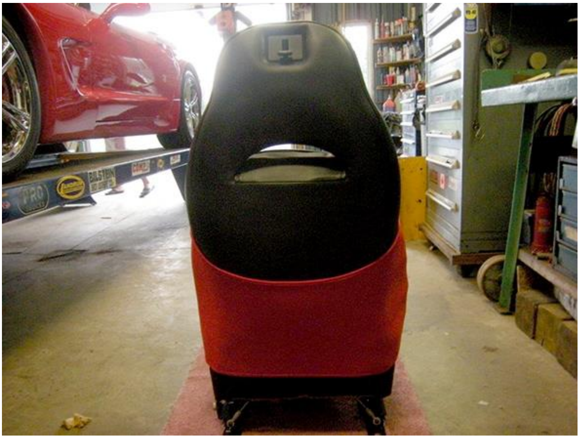
Final rear appearance after the bikini is installed.