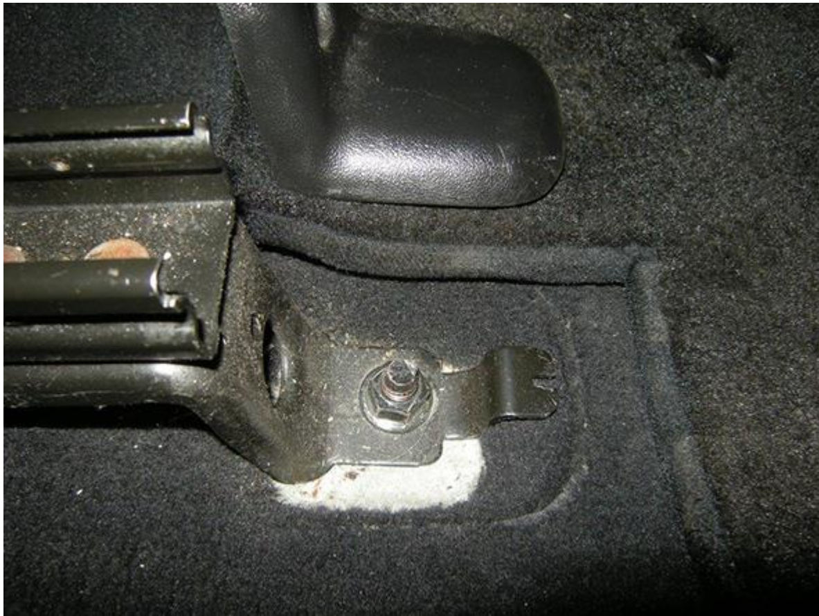
The anchor bolt for the seat is now exposed.