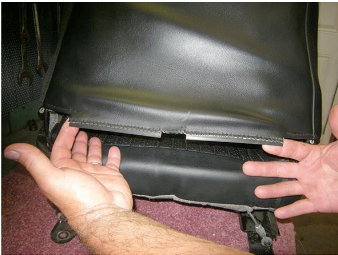
Back of seat - Unclip plastic from the track.